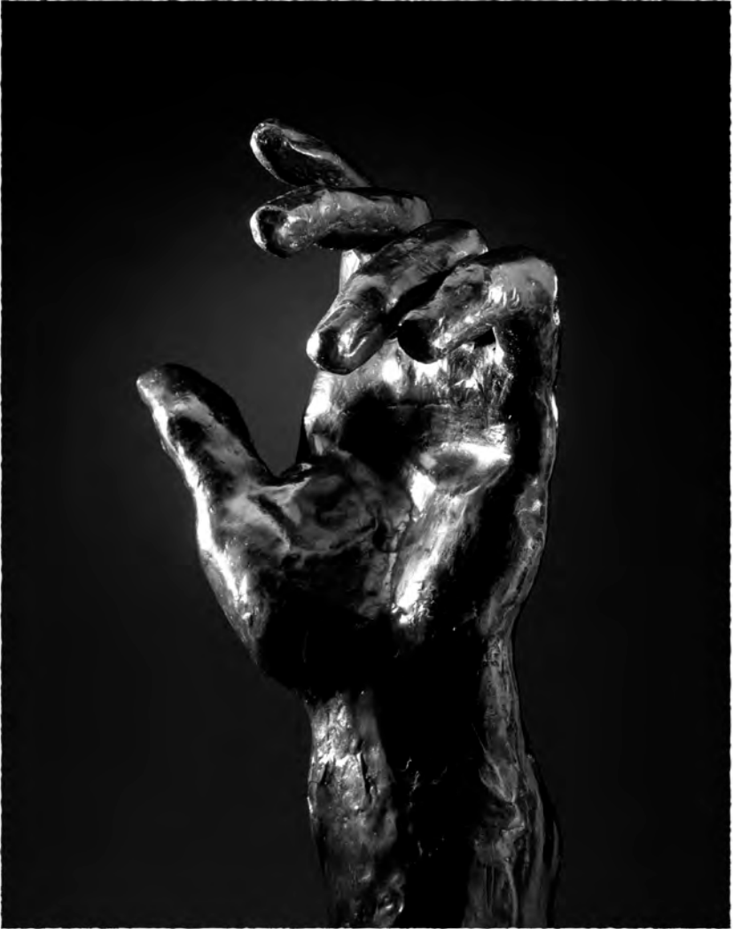
Left Hand of Pierre de Wissant, Auguste Rodin (French, 1840-1917) The Los Angeles County Musuem of Art