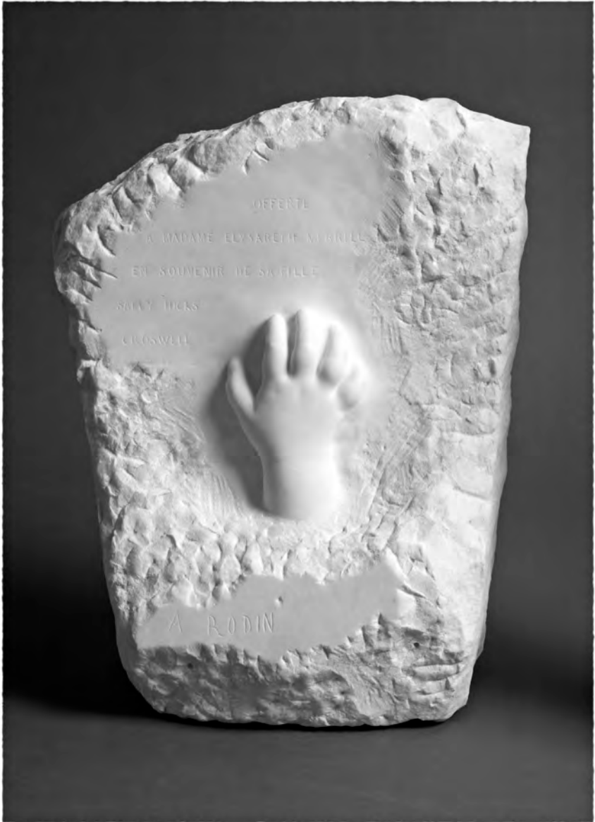
Memorial Relief (Hand of a Child) , Auguste Rodin (French, 1840 - 1917) The National Gallery of Art