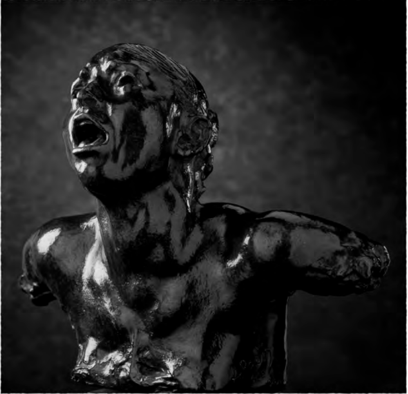
The Cry, Auguste Rodin (French, 1840 - 1917) The Los Angeles County Museum of Art