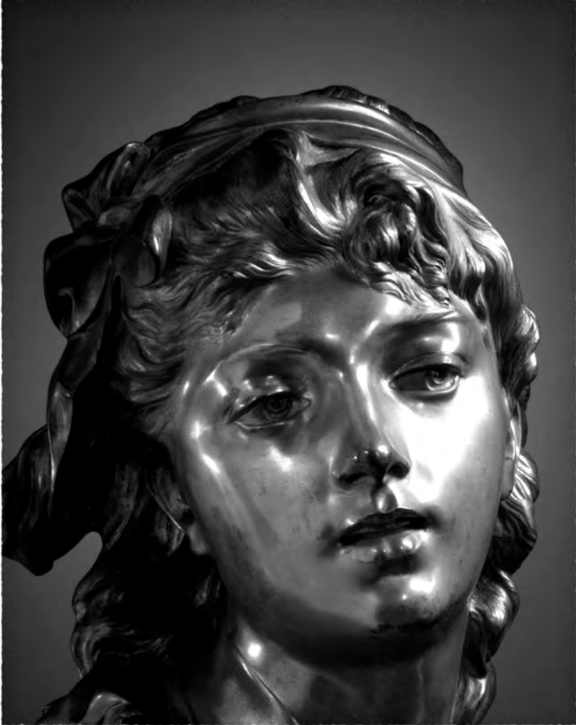
Suzon, Auguste Rodin (French, 1840 - 1917) The Los Angeles County Museum of Art