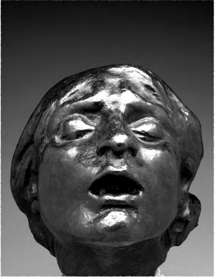
Head of Sorrow, Auguste Rodin (French, 1840 - 1917)