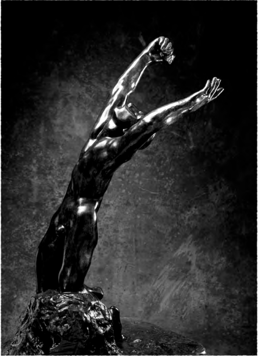
The Prodigal Son, Auguste Rodin (French, 1840 - 1917)