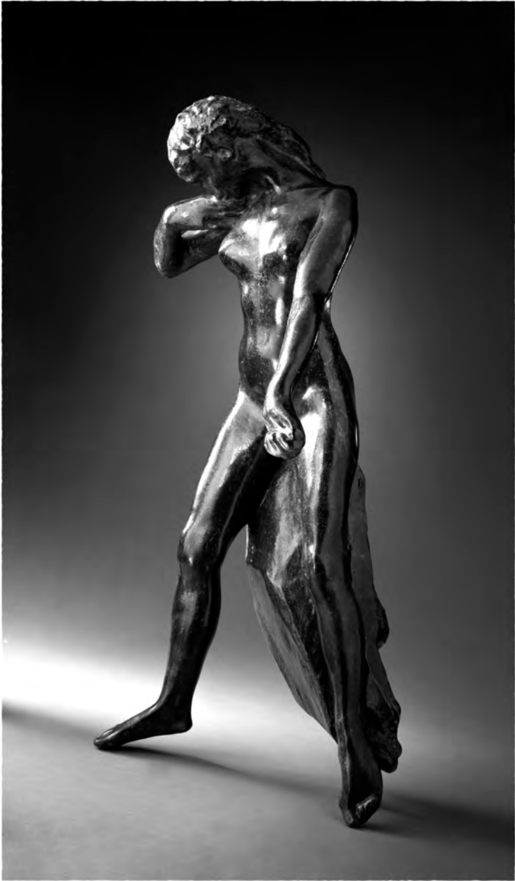
Standing Female Faun, Auguste Rodin (French, 1840 - 1917) The Los Angeles County Museum of Art