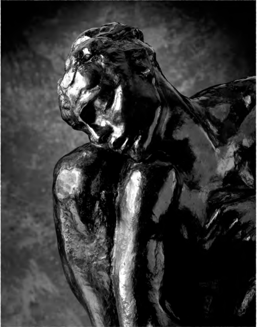
The Crouching Woman, Auguste Rodin (French, 1840 - 1917)