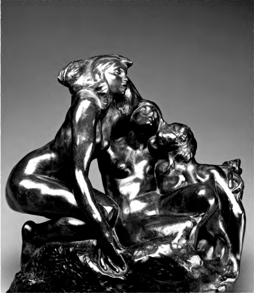
The Sirens, Auguste Rodin (French, 1840 - 1917)