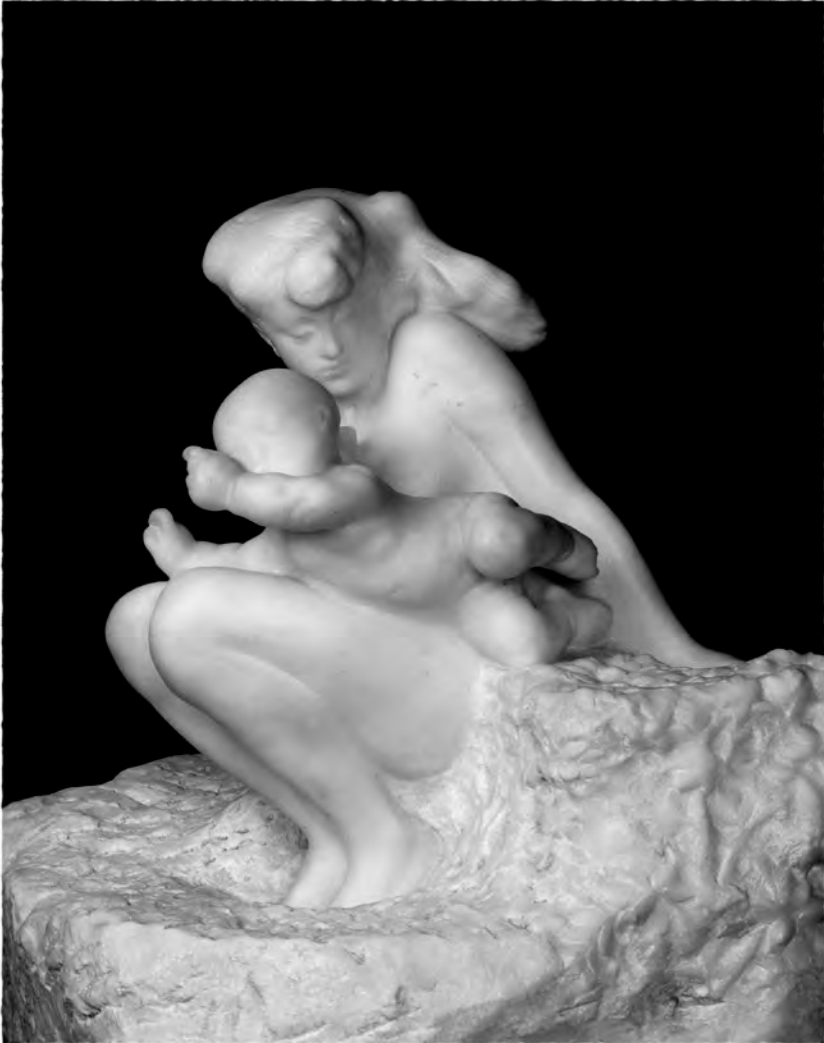
Woman and Child, Auguste Rodin (French, 1840 - 1917)