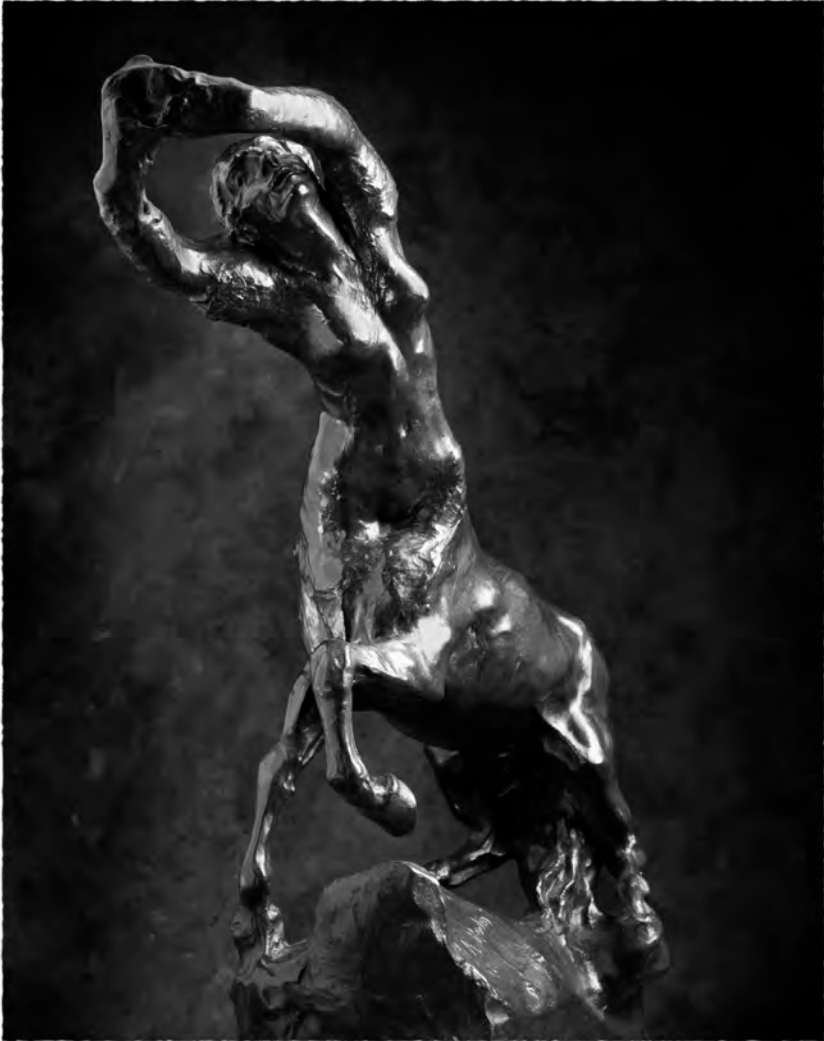
Female Centaur, Auguste Rodin (French, 1840 - 1917) The Los Angeles County Museum of Art