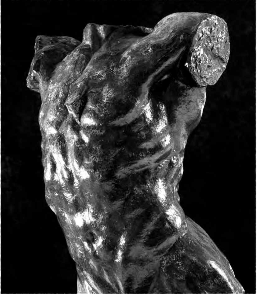
Torso of 'The Falling Man', Auguste Rodin (French, 1840 - 1917) The Los Angeles County Museum of Art