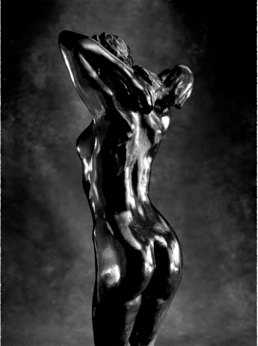
The Kneeling Female Faun, Auguste Rodin (French, 1840 - 1917) The Los Angeles County Museum of Art