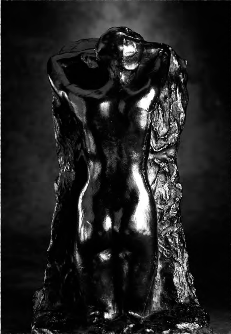
La Douleur (de La Porte), Auguste Rodin (French, 1840 - 1917) The Los Angeles County Museum of Art