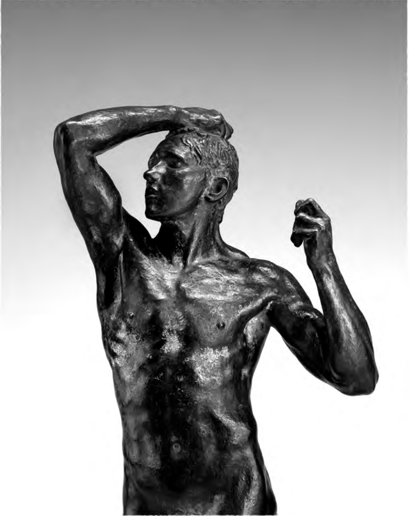
The Age of Bronze, Auguste Rodin (French, 1840 - 1917) The National Gallery of Art