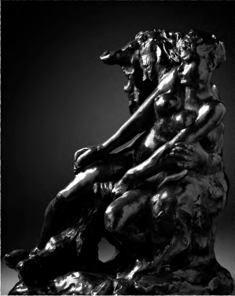
Minotaur or Faun and Nymph, Auguste Rodin (French, 1840 - 1917)