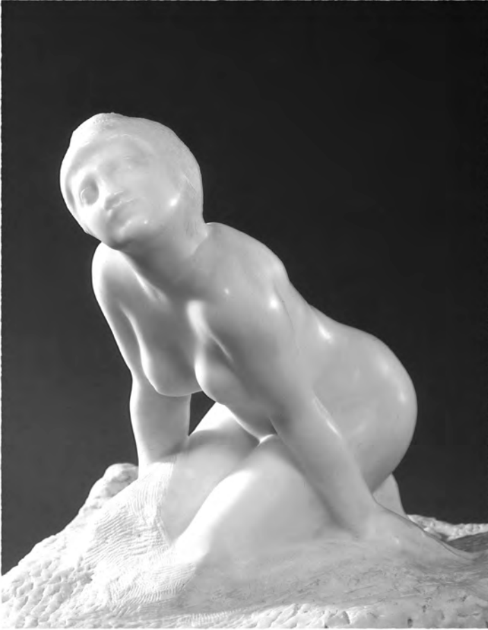
Figure of a Woman "The Sphinx", Auguste Rodin (French, 1840 - 1917) The National Gallery of Art