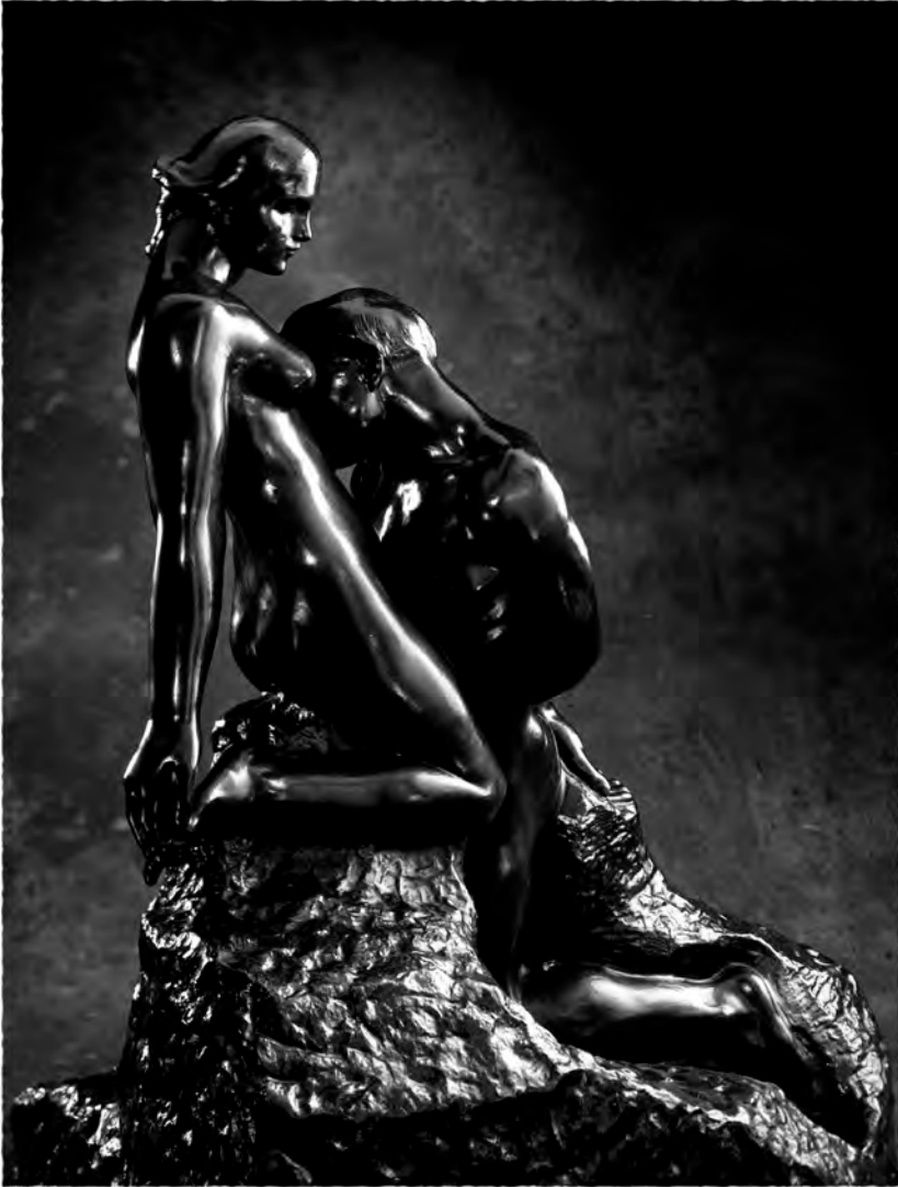
Eternal Idol, Auguste Rodin (French, 1840 - 1917)