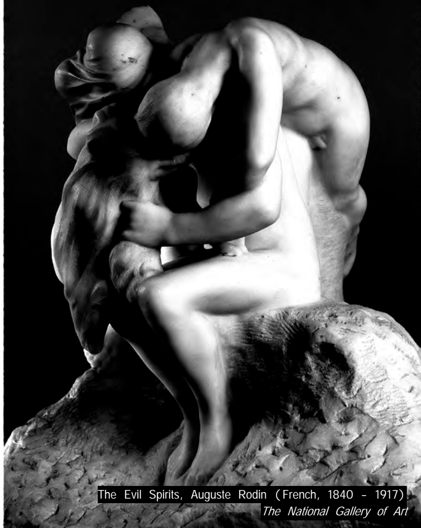
The Evil Spirits, Auguste Rodin (French, 1840 - 1917)

INCLUDING EXCERPTS FROM 'SONNETS TO ORPHEUS'