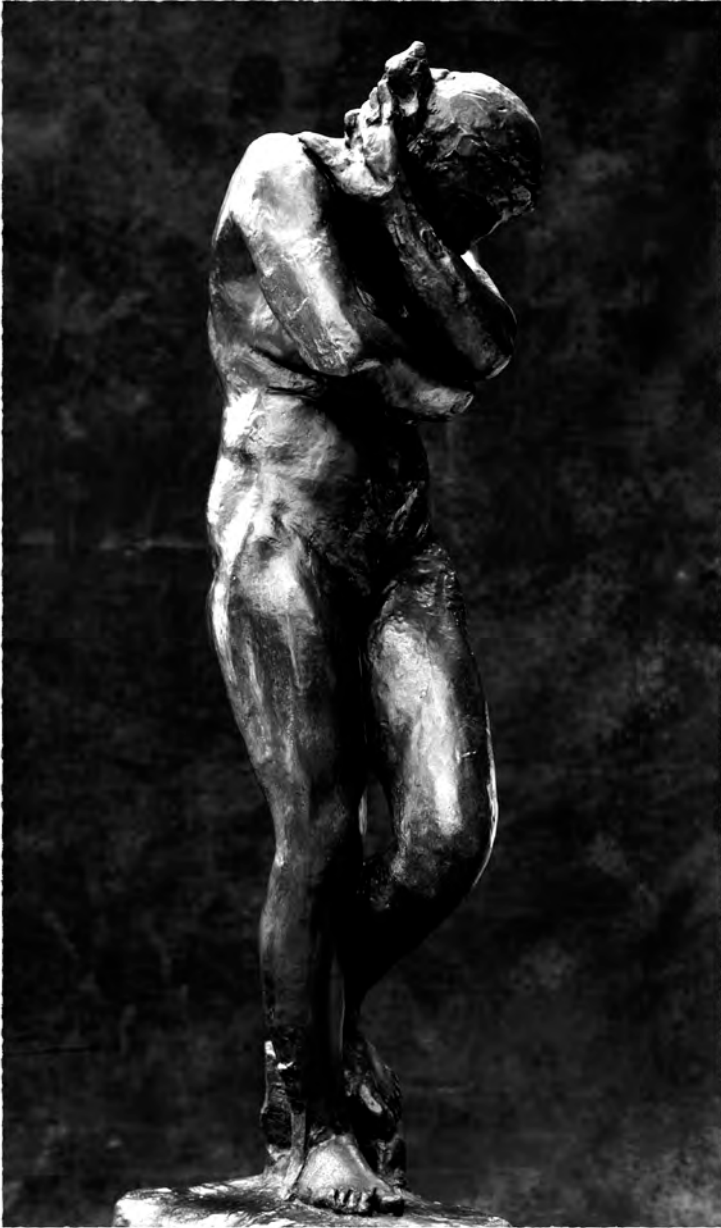
Eve, Auguste Rodin (French, 1840 - 1917) The Los Angeles County Museum of Art