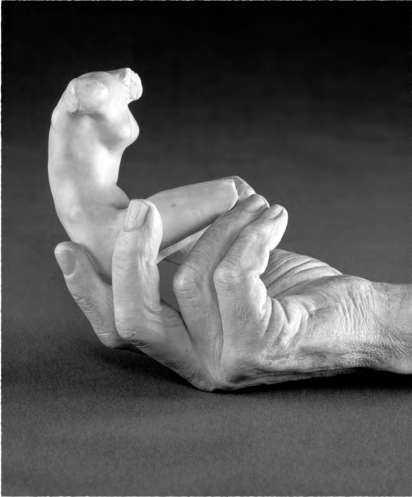
Hand of Rodin with a Female Figure, Auguste Rodin (French, 1840 - 1917) The National Gallery of Art